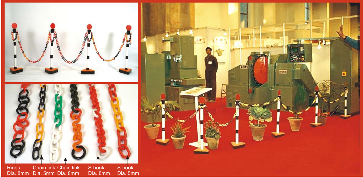
Rings Dia. 8mm Chain link Dia. 5mm Chain link Dia. 8mm S-hook Dia. 8mm S-hook Dia. 5mm

A reputation of any Organization depends upon the work environment, disciplined code of conduct and safety measures taken to avoid accidents. For this purpose importance of demarcation of various areas is necessary. We have developed Plastic StandPole and Chain for demarcation which is decorative as well, that enhances the aesthetics of your organisation.